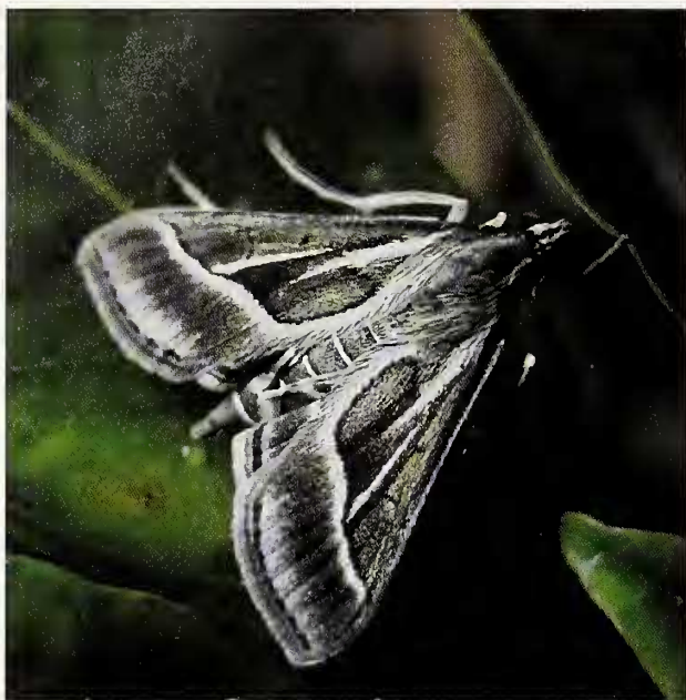
FIG. 1. Adult Omiodes continuatalis moth.

females can lay more than 400 eggs over their lifetime, and up to 122 eggs in a 24 hour period. Egg masses are composed of even rows or clusters of flattened eggs, slightly overlapping one another (Fig. 2). Eggs have a mean width of 1.22mm ( \pm 0.025 ) ( n = 50 ), are light yellow in color, and exhibit fine surface reticulations and an iridescent sheen. Omiodes continuatalis eggs took four days to hatch at 32°C, and eight days to hatch 22°C.